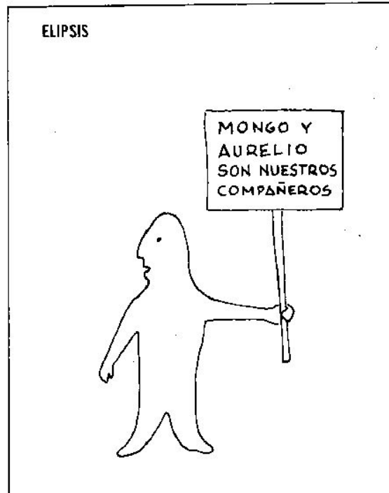
Illustration 7. Militancia , N°9, 9 de agosto de 1973, p. 21.

youth was put into question 11 . Through the character Tendencia, there is a clear identification between the magazine and the Peronist left-wing sectors. [Illustration 7]