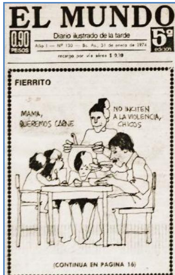
Illustration 8 Fragmento de la tapa del diario El Mundo , N°130 15 de enero de 1974.

Another character that El Caudillo included only once was “Fierrito,” a character from the newspaper El Mundo linked to the PRT-ERP. Fierrito, drawn as a young skinny and mustached man, used to appear on the cover of the newspaper and it illustrated some political or social event that was explained in simple language on the inside pages. The director of El Mundo , Manuel Gaggero, noticed in a report that: ‘Fierrito, which was a kind of contemporary and working Martín Fierro, became a quite significant character synthesizing what happened in the day. In the talks I had over the country I was always asked about Fierrito.’ 12