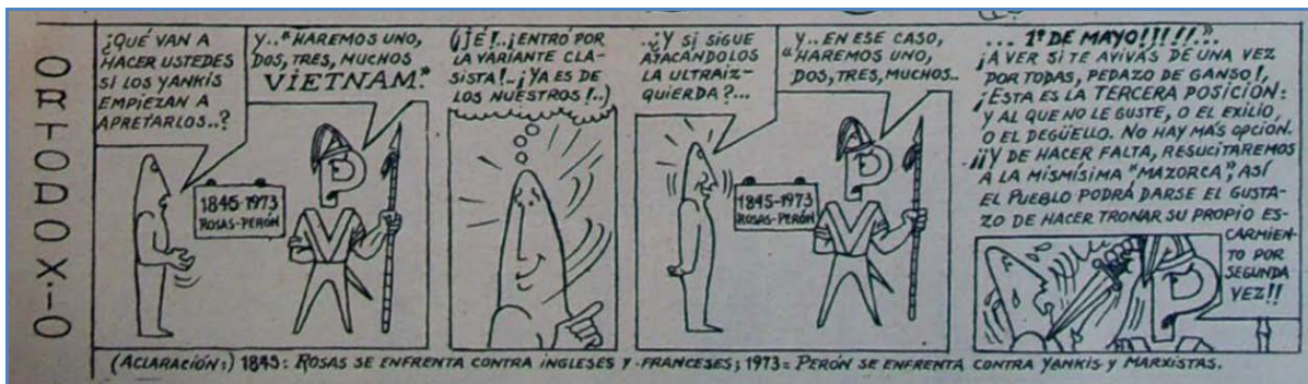
Illustration 14 EC, N° 32, 21 de julio de 1974, p. 23.

See if you stir up once and for all, you little goose! This is the third position, and although you do not like it, or exile or beheading. There is no choice! And since it is lacking we will resurrect the very ‘Mazorca,’ so the people can enjoy the opportunity to let the example of your own come to light a second time!! 18