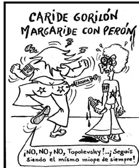
Illustration 5. EC, N°7, 28 diciembre de 1973, p. 23.