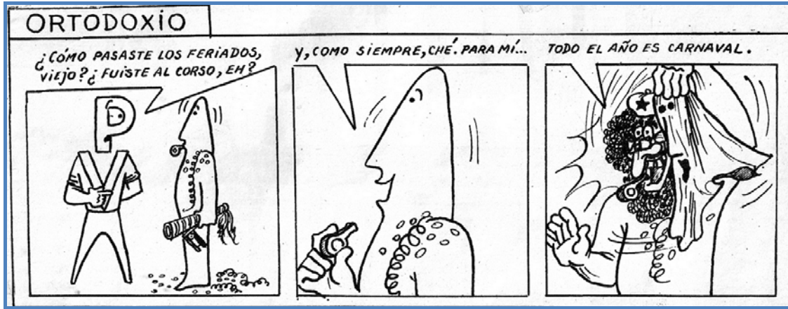
Illustration 10 EC, N°17, 8 marzo de 1974, p. 23.

8, 1974, after the Corsican holidays, Tendencio removed his hood as he said: ‘For me, the whole year is Carnival.’ Below, he appeared with a beard, long hair, sunglasses, wearing a starred beret. [Figure 10].