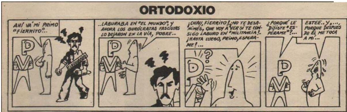
Illustration 9, N° 19, 22 de marzo de 1974, p. 23.

As we have seen, in several strips and vignettes of El Caudillo there was criticism of the Peronist left-wing. In issue 23, Tendencio was represented with a poster that reads 'JUP Montos' as he pushed a part of the box frame. Asked by Ortodoxio , who urged him to leave the space that belonged to him, Tendencio answered: