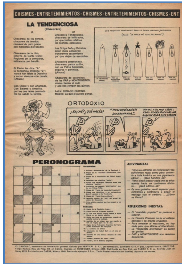
Illustration 1. Humor section of El Caudillo (EC), N°7, 28 de diciembre de 1973, p. 23.

An analysis of these caricatures allows us to find continuous aesthetic features that helped creating a stereotype of the leftist militant. The stereotype, as pointed out by Burke (2005), may not be entirely false, but it often exaggerates actual elements and omits other elements. The caricaturist appeals to pre-existing prejudices while he reinforces them and, as noticed by Burke, “The stereotype may be more or less cruel, more or less violent, but in any case it is necessarily devoid of nuances, because the same model applies to cultural situations that considerably differ from one another.”