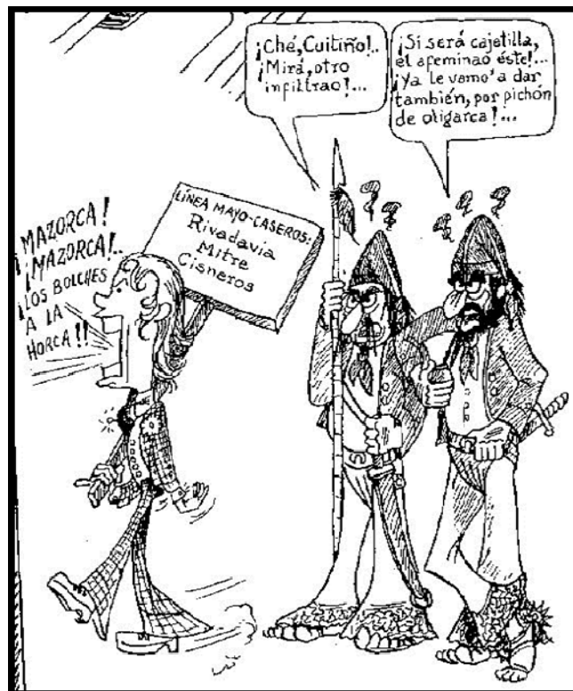
Illustration 13 EC, N°49, 1 noviembre de 1974, p. 23.

In a vignette [Illustration 13], two mazorqueros with vintage clothes, looking at a young well-dressed man on the street, shouted “Mazorca!, Mazorca!, The bolsy to the gallows!” The boy, an alleged representative of the oligarchy, was carrying a poster that claimed the liberal story “Mayo-Caseros: Rivadavia, Mitre, Cisneros.” The mazorqueros looked contemptuously: “– Hey, Cutiño! Look, another undercover agent! – Yeah, he will be packeted, such a ladylike man! And we will give him something, too, pigeon-breasted oligarch!..”