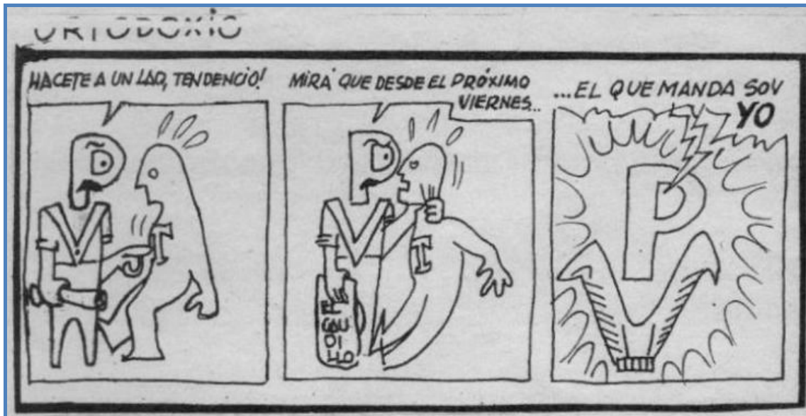
Illustration 6 EC, N°4, 7 diciembre de 1973, p.23.

Since the issue 4 on December 7, 1973, the various caricatures on the humor page shared their space with a funny strip consisting of three boxes entitled ‘Ortodoxio.’ Under that name there was the flagship character of the magazine, which was rolled up to the elbows, wore mustaches, and had a P-shaped head that fit through a big V-shaped neckline. In the strip, Ortodoxio, holding a copy of El Caudillo in his left hand, said: “Move over Tendencio!, see that since next Friday... I am the BOSS,” as he touched Tendencio on the neck with his right hand. This Tendencio was similar to that drawn in Militancia , but he had a huge T on the chest. [Illustration 6]