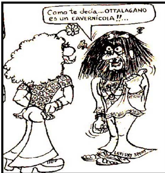
Illustration 4. EC, N°55, 17 diciembre de 1974, p. 23.

Some women's gestures and clothes are added to characterize them as homosexuals [Illustration 4] and junkies [Illustration 5].