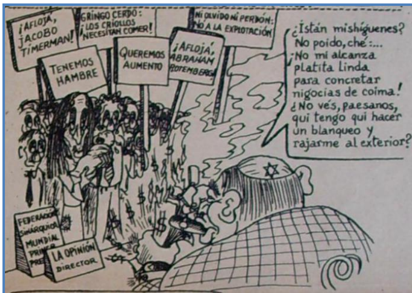
Illustration 15 EC, N° 32 del 21 de junio de 1974, p. 23.

However, anti-semitism was not observed only in the characterization of the Tendencia, but also in other figures in the public sphere as the Economy Minister José Gelbard or the director of La Opinión , Jacobo Timerman. Criticism to Gelbard became more frequent after Perón's death, 28 while Timerman always faced it: on the occasion of a labor dispute in the newspaper, a caricature of its Director at the office has a small poster: "Federación sinárquica mundial, primer presidente". In front of him, starving employees hold posters up: "Gringo cerdo. ¡Los criollos necesitan comer!" Impassive, Timerman lights a Cuban Cigar with a ticket and says: "– Are they mishiguenes? I do not mind, my friend... I cannot afford a little money, nice to do bribery business! Do not you see, country folk, that I have to wash money and escape abroad?" 29 [Illustration 15].