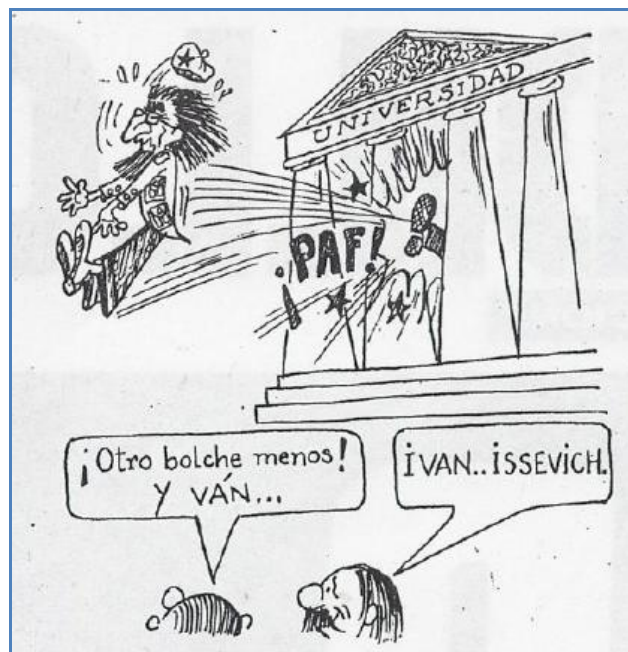
Illustration 12 EC, N°52, 26 de noviembre de 1974, p.23.