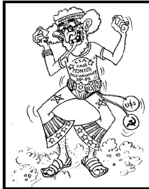
Illustration 3. EC. N°7, 28 diciembre de 1973, p. 23.

Some women's gestures and clothes are added to characterize them as homosexuals [Illustration 4] and junkies [Illustration 5].