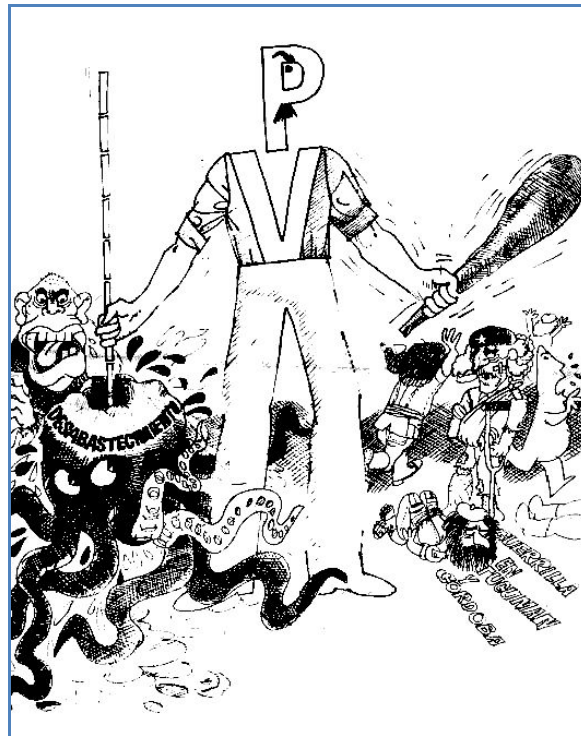
Illustration 4 EC, N° 63, 19 de febrero de 1975, p. 23.