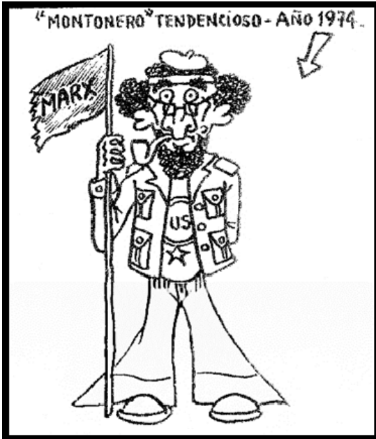
Illustration 2. EC, N°15, 22 febrero de 1974, p. 23.

aquiline nose, and insignias such as the Star of David, the hammer and sickle, or the American flag. These traits sought to emphasize the characterization of sectors of the Tendencia Revolucionaria as intellectuals (hence, not workers); Marxists [Illustration 2] (not Peronists; i.e. undercover agents); Jews (stateless) and pro-Yankees (CIA agents) [Illustration 3].